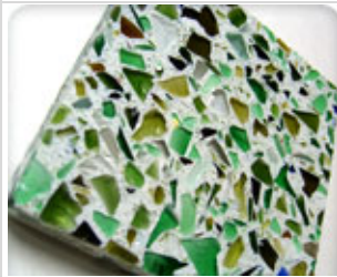
Recycled glass countertops Vetrazzo

By LA Green Building Examiner , Chris Bay November 20, 3:31 PM